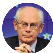
HERMAN VAN ROMPUY President of the European Policy Centre and President Emeritus of the European Council